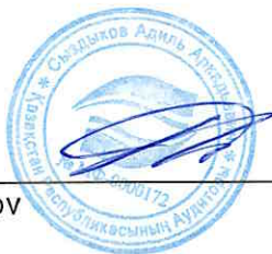
Adil Syzdykov Auditor

Auditor Qualification Certificate No. МФ - 0000172 dated 23 December 2013