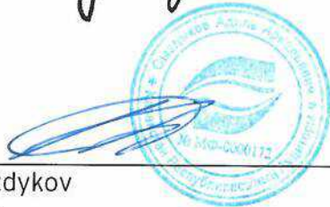
Adil Syzdykov Auditor

Auditor Qualification Certificate No. МФ - 0000172 dated 23 December 2013